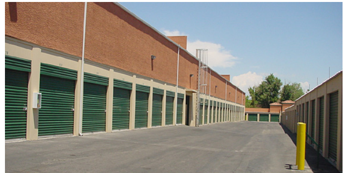
Completed Project: Mini-Storage @ Jones & University