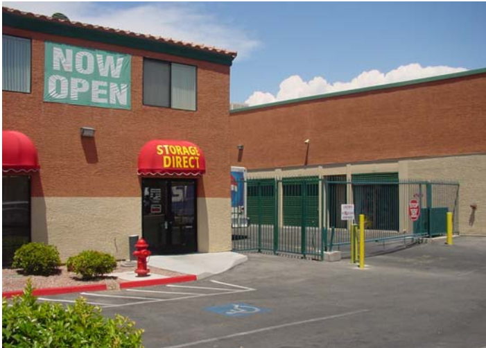
Completed Project: Mini-Storage @ Jones & University