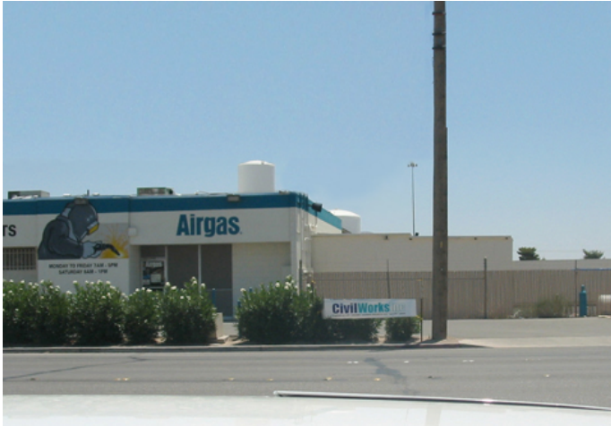
View of the Airgas Facility on Losee Rd., Las Vegas, NV

CivilWorksInc 1 has had the opportunity to be involved in the Civil Engineering Design, Site Improvements Plans, and Agency Processing of " Industrial " facilities in the Las Vegas Valley including: