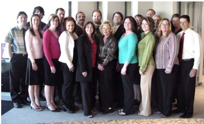
Our CivilWorksInc team ready to serve YOU on your next project!

CivilWorksInc has an exceptional understanding of " Industrial " facility developers, users, and their needs, and has an energy and dedication to help you succeed.